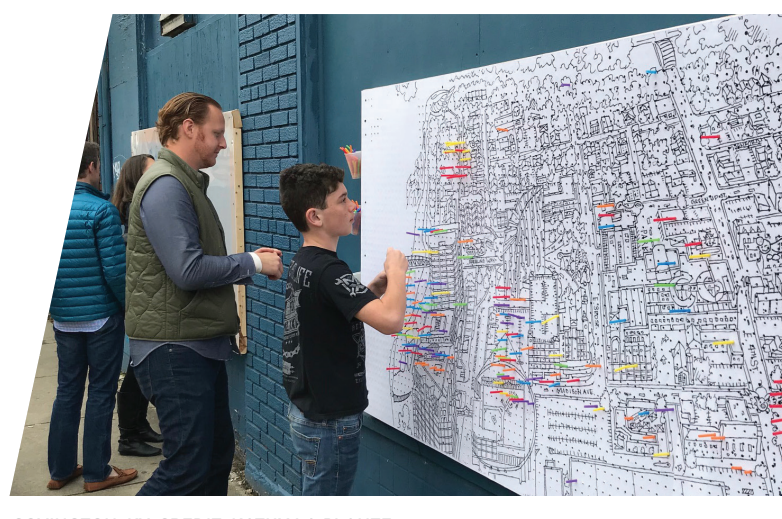
COVINGTON, KY.

Surveys can gather both quantitative and qualitative information. The quality and reliability of the data you collect is dependent on the survey's design and the phrasing of the questions, and on gathering a sample that reflects the population.