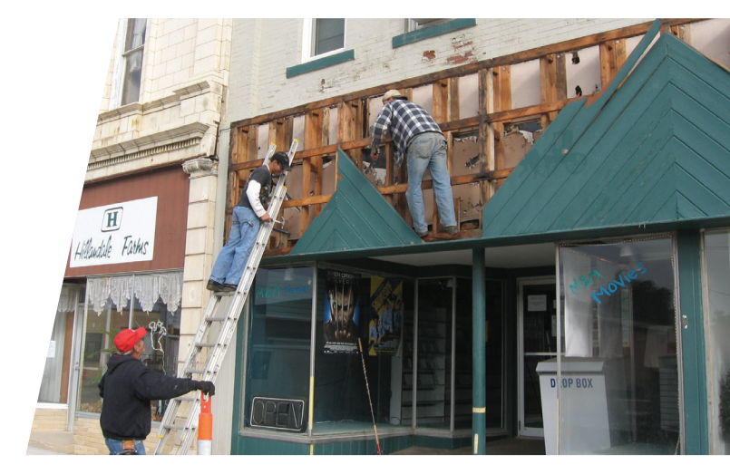
NEW HAMPTON.

An effective Transformation Strategy reflects the community's overall vision, serves a particular customer segment, responds to an underserved market demand, or creates a differentiated destination. A Transformation Strategy guides the direction of the revitalization initiative and, over time, transforms the district. The most valuable outcome of your analysis will be to focus your work around a strategy — and this is also probably the hardest part because it involves choosing one direction over several reasonable possibilities. A companion guide, The Main Street Approach: A Comprehensive Guide to Community Transformation , offers a more detailed look at how to develop and implement Transformation Strategies — and the data you've collected here will serve as the foundation.