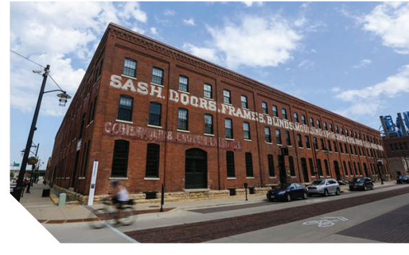
DUBUQUE, IOWA.

All of these are available online by using the American Fact Finder tool at census.gov.